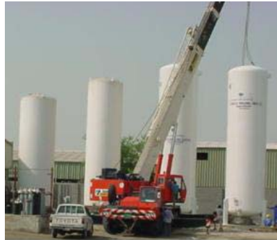
Two New storage tanks been added to the two existing in Abu Dhabi

The response to our exhibition stand was quite encouraging while getting positive nod from our visitors.